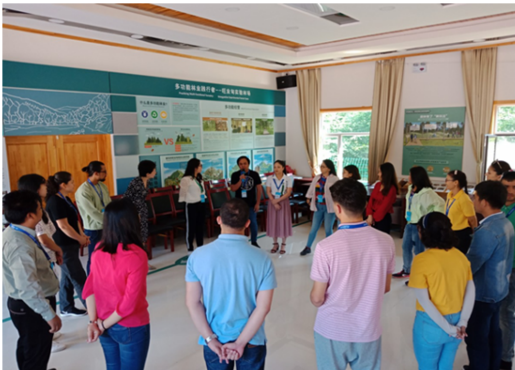
ASP students experience sharing activity in Inner Mongolia

The creation of the APFNet Alumni Network has been a helpful avenue to connect among its alumni and students in the Asia-Pacific region. At the start of 2022, a survey was conducted to gather insights and suggestions from our alumni to improve the quality of the newsletter.