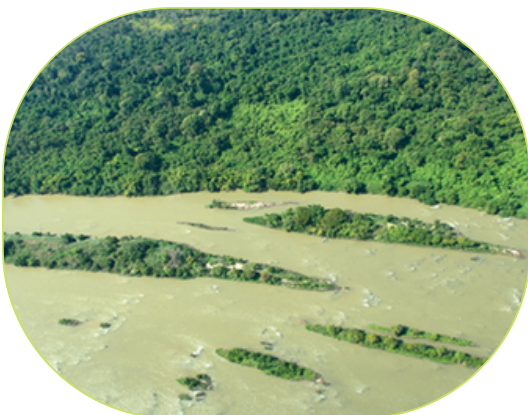
Siem Pang Wildlife Sanctuary, Cambodia

Siem Pang Wildlife Sanctuary Forest area is located in far North-Eastern Cambodia, in Stung Treng Province, east of the Mekong River. It covers a total of 132,321 hectares, and this protected area is managed by the Ministry of Environment and the Department of Environment of Stung Treng.