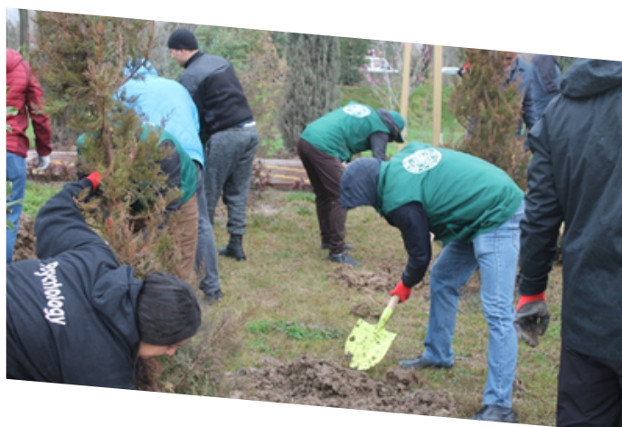
Fayzmamad is joining a tree-planting activity

Finally, I cordially ask every young researcher or forester to contribute a certain portion of their commitments to environmental conservation through forest activities such as tree-planting campaigns.