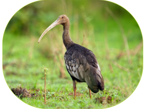
Eld's Deer in Siem Pang Wildlife Sanctuary

Siem Pang Wildlife Sanctuary Forest area is located in far North-Eastern Cambodia, in Stung Treng Province, east of the Mekong River. It covers a total of 132,321 hectares, and this protected area is managed by the Ministry of Environment and the Department of Environment of Stung Treng.