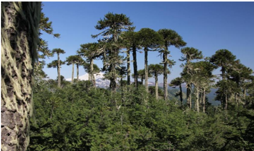
Bosque Pehuen Protected Area in Chile