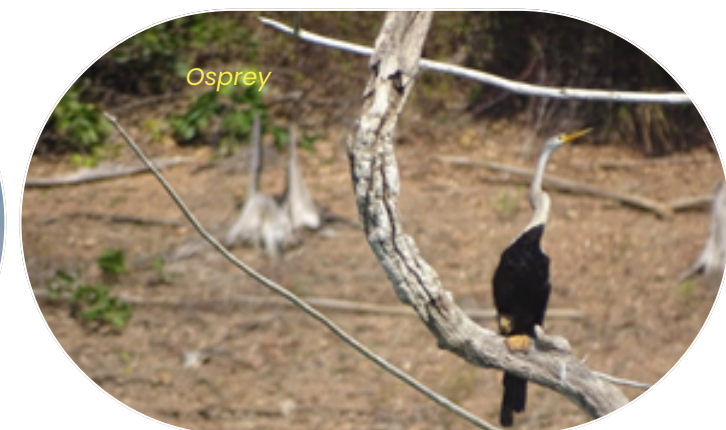
Bird species observed during Nay Yu 's survey

The results provide updates for the bird species distributed in the three dams. Previously, there was no recorded data on the long-term sustainability of the forest bird populations and the probability of detectability in this area. It is clear from this survey's results that the species similarity is very high at the Ngaliike and Sinthe Dam and that areas that have a strong impact on avifauna are to be found in high human pressure such as overfishing, hunting, etc. Prey species of Osprey and near threatened (NT) were refuged only at the Paunglounng Dam which is well covered by natural forest. In conclusion, the findings obtained from this survey have revealed that anthropogenic disturbances in watershed areas have a limited potential to support bird species, and relying on the existing forest cover is not sufficient.